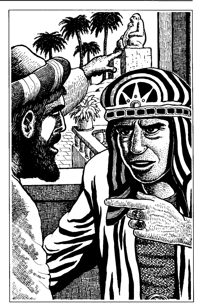
God's prophet warned King Amaziah that he would be destroyed for worshiping the Edomite idols.

"God will destroy you for your idolatry," the prophet continued. "This will